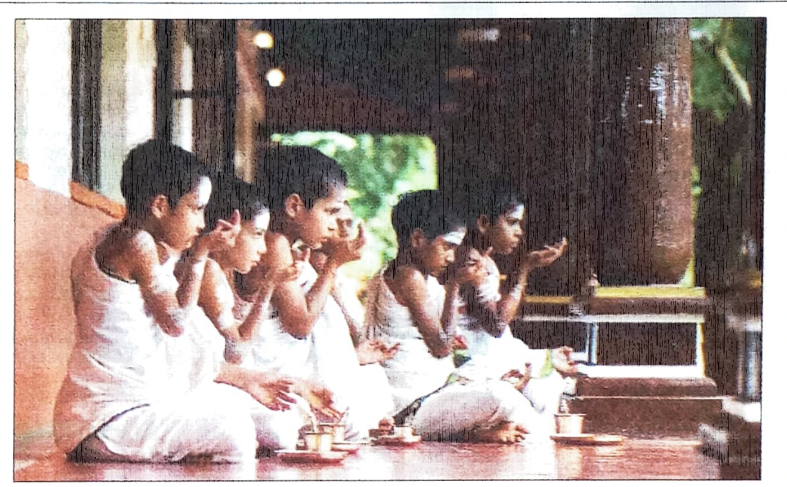
Simultaneous pursuit of modern education and ancient wisdom is necessary for India to move to the higher orbit