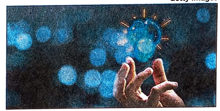
The move will benefit around 31,000 students

The Dr DS Kothari Post Doctoral Fellowship (DSKPDF) amount for the higher postdoctoral fellowship has been increased to Rs 67,000 per month for the entire tenure from the existing Rs 54,000. The post doctoral fellowship for one year now has been in-