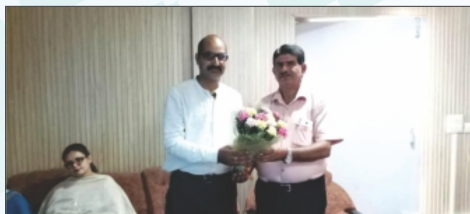
“Career Planning After Graduation” at Govt. Degree College, Bhillawar on 25th September, 2019 in which 82 students participated