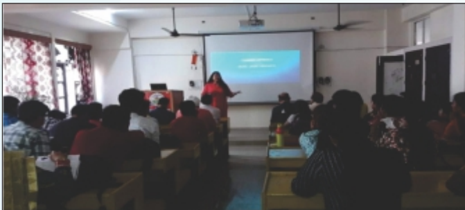
“Career Options in Electronics” at Department of Electronics, University of Jammu on 9th May, 2019 in which 32 students participated