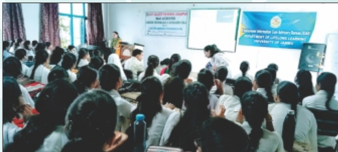
“Career Options in Sciences and Languages” at Govt. College for Women, Udhampur on 29th August, 2019 in which 102 students participated