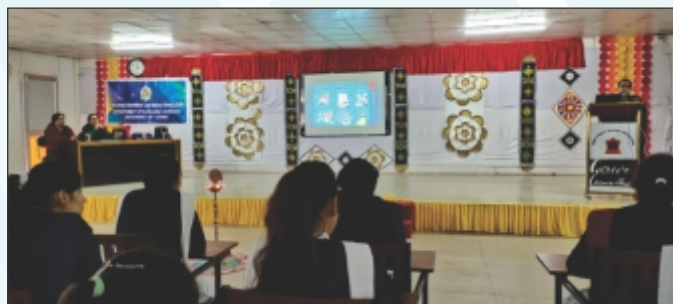
“Career Options in Sciences and Commerce” at Army Public School, Ratnuchak on 15th January, 2020 in which 75 students participated