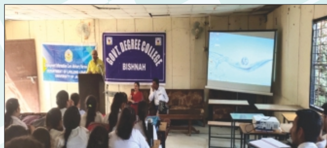
“Career Options in Education and History” at Govt. Degree College, Bishnah on 11th October, 2019 in which 91 students participated