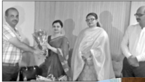
A dignitary being honoured