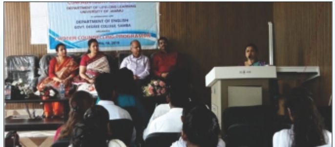
“Career Options in Science and English” at Govt. Degree College, Samba on 16th April, 2019 in which 67 students participated