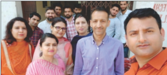
Career Counselling programme at Reasi Campus on 9th April, 2019 in which 25 students participated

Employment Information cum Advisory Bureau, Department of Lifelong Learning organises following Career Awareness Programmes at different Schools, Colleges and PG Departments of University of Jammu during the year 2019-20: