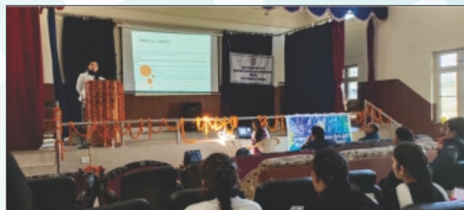
“Importance of Career Counselling” at Govt. College for Women, Kathua on 22nd January, 2020 in which 150 students participated