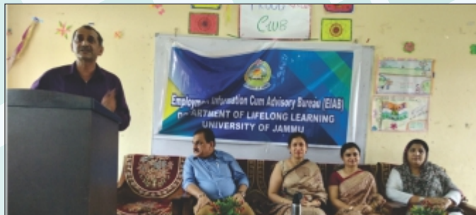
“Career Options in English and Environmental Sciences” at Govt. Degree College, Nagrota on 3rd September, 2019 in which 100 students participated