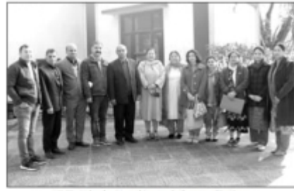
Officials during the workshop at Kathua.