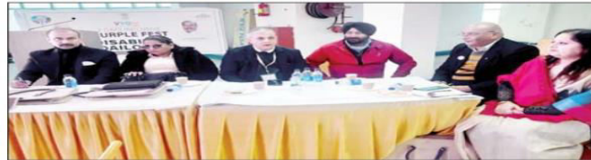
Panel members during the Disability dialogue at JU.