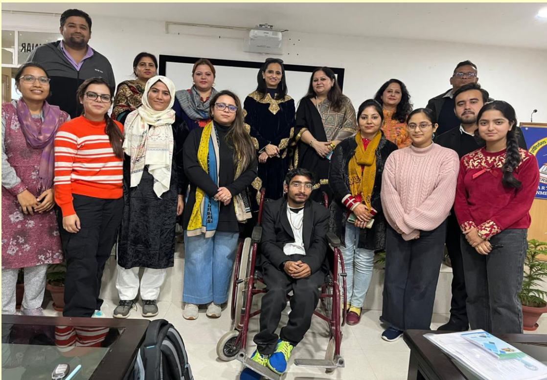
Glimpses from the workshop