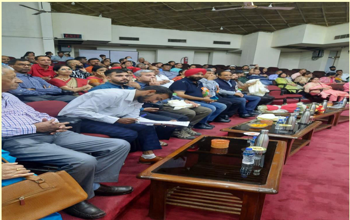
Glimpses of Cultural event for Deaf