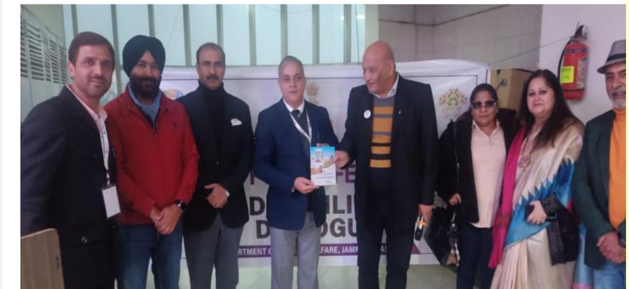
Press coverage of the dialogue