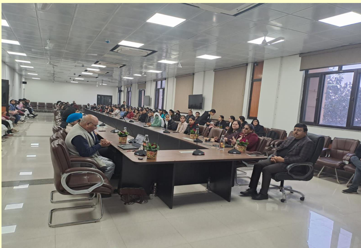
Clicks from the workshop