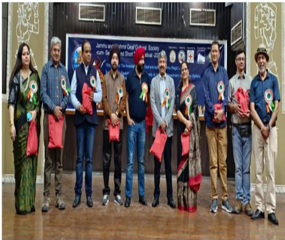
Dignitaries at deaf and dumb film festival in Jammu on Sunday.