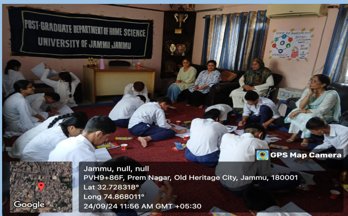
Children making posters

Children of the J&K Samaj Kalyan School for hearing impaired, Shaheedi Chowk, Jammu showcased their artistic talents through posters that vividly captured the essence of their Deaf experience. Each entry emphasized themes of inclusivity, empowerment, and the importance of breaking communication barriers. Some of the posters portrayed the beauty of sign language, while others focused on the challenges faced by the Deaf community in their everyday lives.