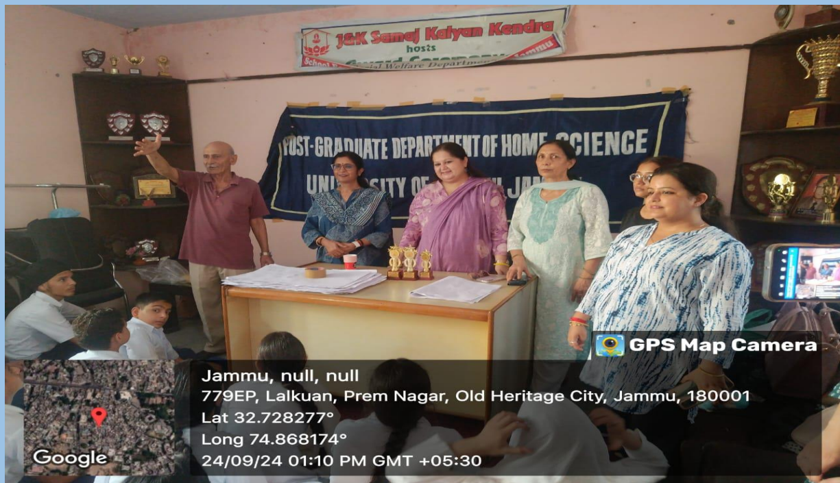
Glimpses of the award ceremony of the competition