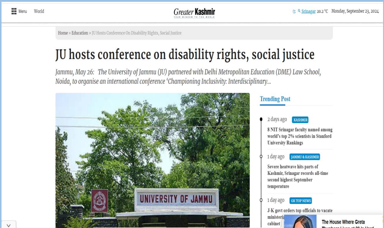
Press coverage of the Conference