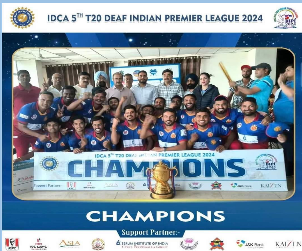
Captures of the championship

Students and staff of the University also witnessed the matches with great enthusiasm.