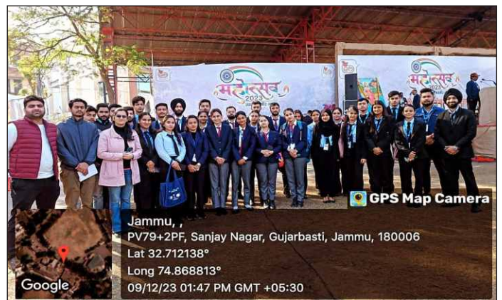
Dec 9, 2023: BBA (HM) and MBA (TTM) students participated in Mahotsav-2023, Jammu, Kashmir and Ladakh organized by LEAD at Gulshan Ground, Jammu.