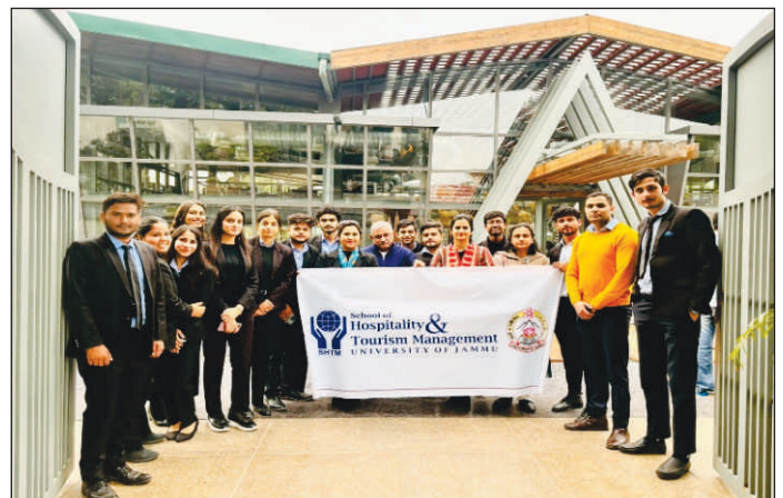
Nov 29, 2023: Students of MBA (TTM) and BBA (HM) visited Amantran farms to understand the various aspects of event management.