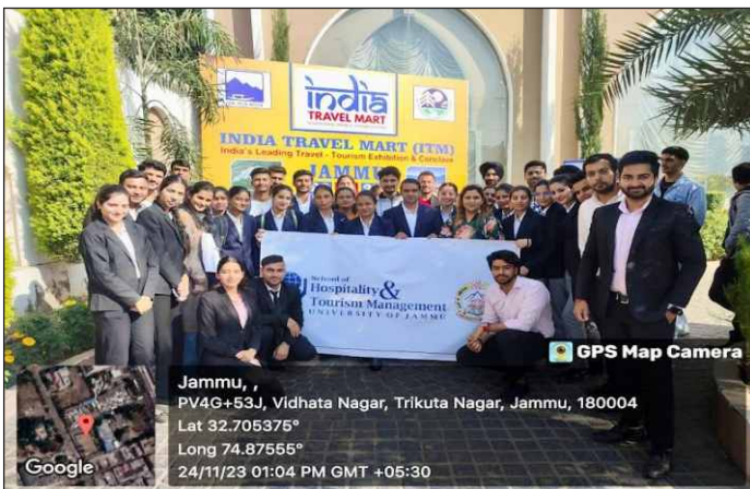
Nov 24, 2023 : MBA (TTM) 1 st Semester students visited India Travel Mart (ITM), a platform to know about the latest trends in the field of travel and tourism industry.