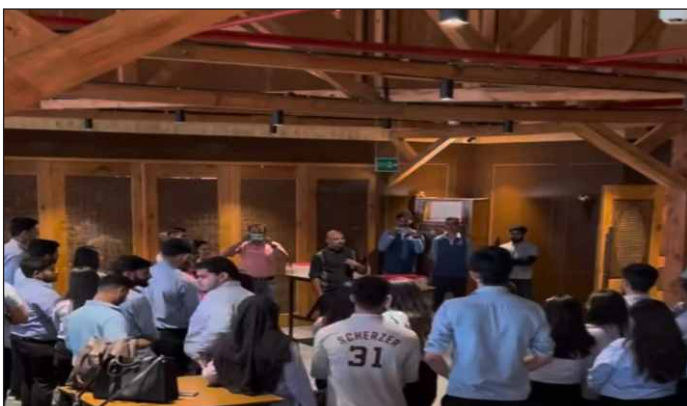
May 30, 2024: Chef interacted with the students of BBA (HM) during their visit to Skyview by Empyrean, Patnitop.