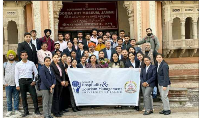
Nov 23, 2023 : A heritage walk to Mubarak Mandi complex during World Heritage Week was organized for the students of MBA (TTM) as a part of Experiential Learning Course.