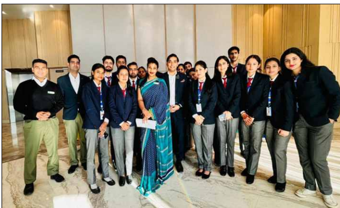
Dec 8, 2023: MBA(TTM) 1 st Semester students visited Hotel Holiday Inn, Katra (an IHG Property) to experience backend functioning of an international hotel.