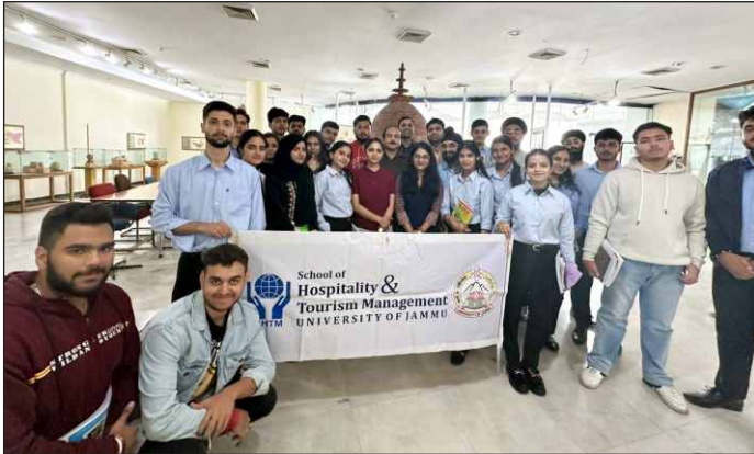
Oct 20, 2023 : BBA (HM) 1 st Semester students visited the Sheikh Noor-ud-Din Noorani Museum of Heritage at General Zorawar Singh Auditorium, University of Jammu.