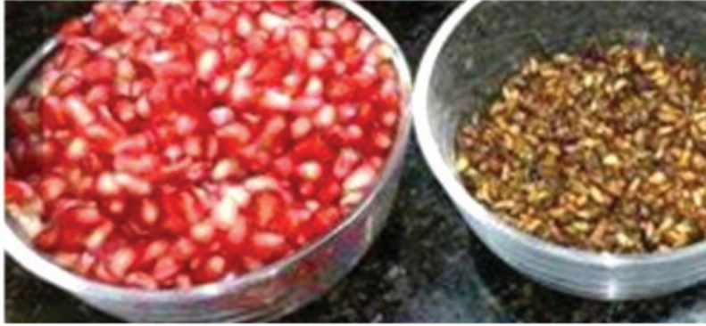
Anardana: locally known as Daaru or doen in Pahari, Siraji and Kashmiri language

Jammu: Ramban district, nestled in landscapes of Jammu and Kashmir, has recently gained recognition for its Indigenous produce - Anardana, known locally as Daaru. This wild sour pomegranate variety has not only captivated the taste buds but also emerged as a significant economic asset for the region. With the granting of the Geographical Indication (GI) tag in October 2023, the spotlight has turned towards Ramban's thriving Anardana industry, which produced a staggering 866.3 metric tons during the 2022-2023 period. Anardana, or Daaru as it is called in the Pahari and Sarazi languages, grows abundantly across the Mid Himalayan hill slopes of Jammu and Kashmir, particularly in Ramban district. The fruit, rich in antioxidants and medicinal properties, flourishes in the mid-temperate to subtropical climate, primarily on calcareous low-fertility soils. Spanning over 365.75 hectares of hill slopes in various areas like Batote, Champa, Peera, Chanderkote, and others, the cultivation of Daaru in-