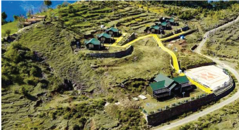
VENUE: At Panchari Hill Station (Therijungle)

village. The famous Guchchi vegetable is highly valued in the area for its medicinal properties. Another famous destination here is the village of Meer. This village is mostly of hilly terrain and only a very small portion is used for agriculture. Here, the famous Sankari Devta temple has idols of deities which are known to be of Shiva and Shakti. The temple is said to be about more than 500 years old. The famous Sankari mela is also organised in the month of August or September in which a huge crowd of people come together and take the blessing of Baba Sankri. Visitors can enjoy the rich folk music, dance, and other cultural traditions. One of the most prominent traditional folk dance forms that the people of the pahari community mainly perform is characterized by rhythmic and energetic movements accompanied by beats, dhol and a traditional drum. It is not only a form of entertainment but also holds cultural and social significance, as it reflects the traditions