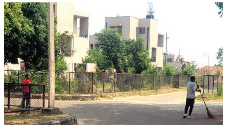
Cleaning frontiers are at University of Jammu