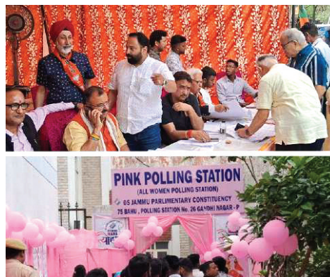
Voters in Jammu, exemplifying healthy and orderly participation during elections