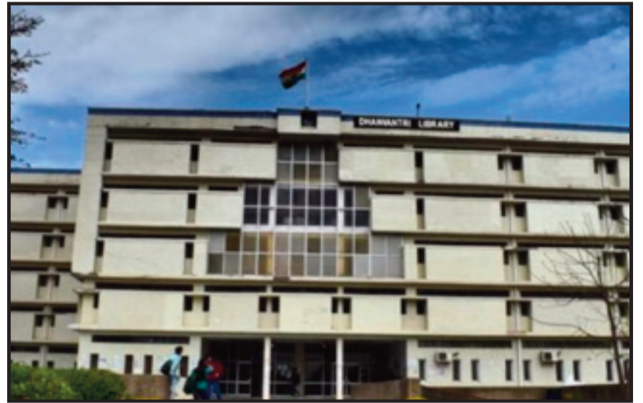
Dhanvantri Library in all it's glory

erations. The library's dedicated staff members are well-versed in assisting students and scholars in their quests for knowledge, providing guidance on research methodolo-