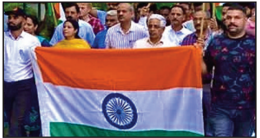
JU VC Flags off Tiranga Rally under 'Meri Maati Mera Desh'

In continuation of series of events organised by the University of Jammu to commemorate the 77th Independence Day, a Tiranga Rally