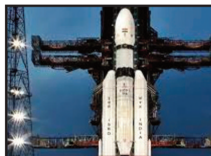
Chandrayaan-3 at the launch pad

on 23 August 2023 wherein a rover on the lunar surface, equipped with advanced instruments to analyze soil composition, mineral distribu-