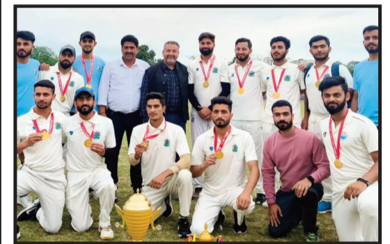
Victors in Jubilant mood

The tournament featured a diverse array of activities, including Cricket matches, Badminton (M&W), Volleyball (M), Chess (M&W), Carrom (M&W) & Table Tennis (M&W). The main focus of this tournament were cricket matches in which Physical Department won over Urdu Department in the finals.