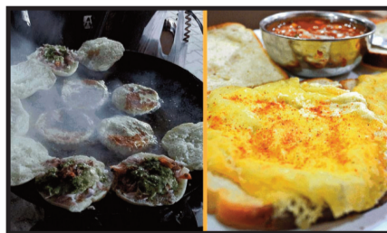
Kalhari a taste to behold

Jammu, October: Kalhari is a well-known culinary delicacy hailing from the Udhampur district in Jammu. It has garnered immense popularity among food enthusiasts in Jammu and Kashmir, thanks to its distinct cheese. The cheese used in Kalhari is made from cows' or Buffalo's milk by boiling milk and adding sour-type yeast, which gives it a semi-soft texture. It is rich in nutrients, making it a healthy choice