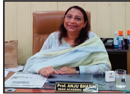
JU Post in conversation with DAA

The keyword for success is 'team-work', especially between teachers and students. When we work together, we can achieve so much more than when we work alone. Having team spirit and coordination between team members is essential,