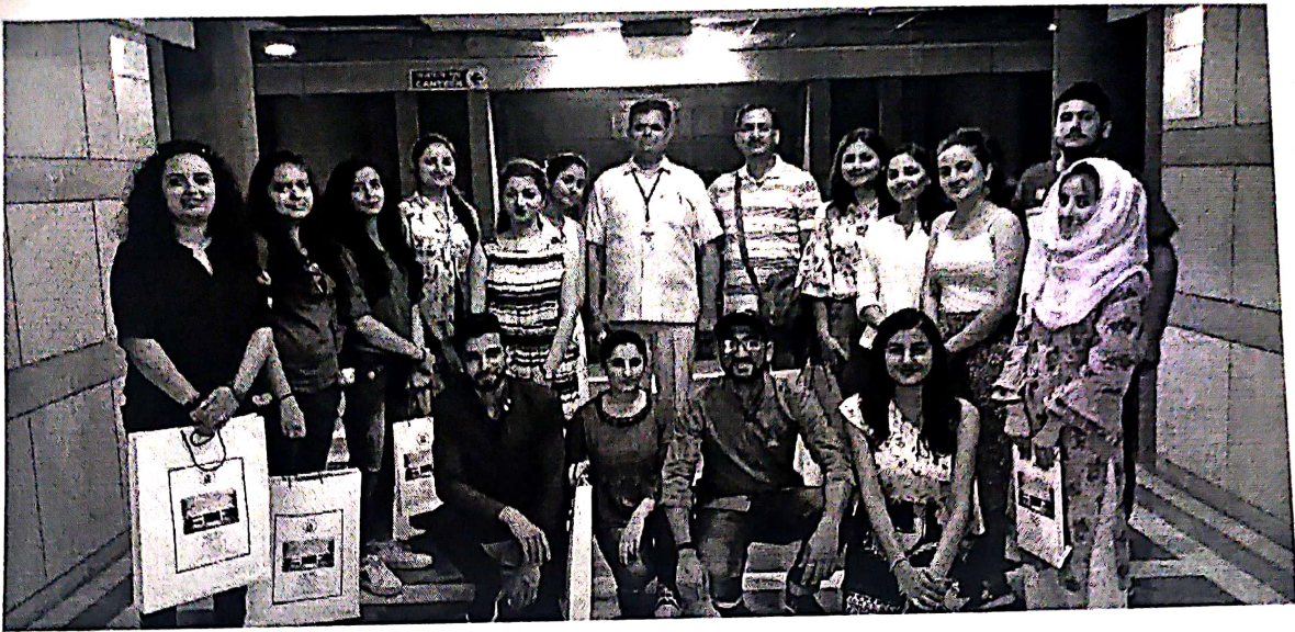
The whole journey was full of excitement and memorable.