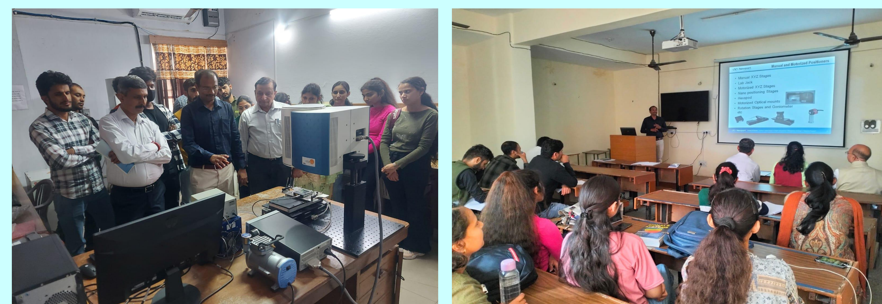
Two-day Workshop on 'Internet Of Things and Artificial Intelligence' to commemorate National Science Day on 28 th and 29 th February 2024