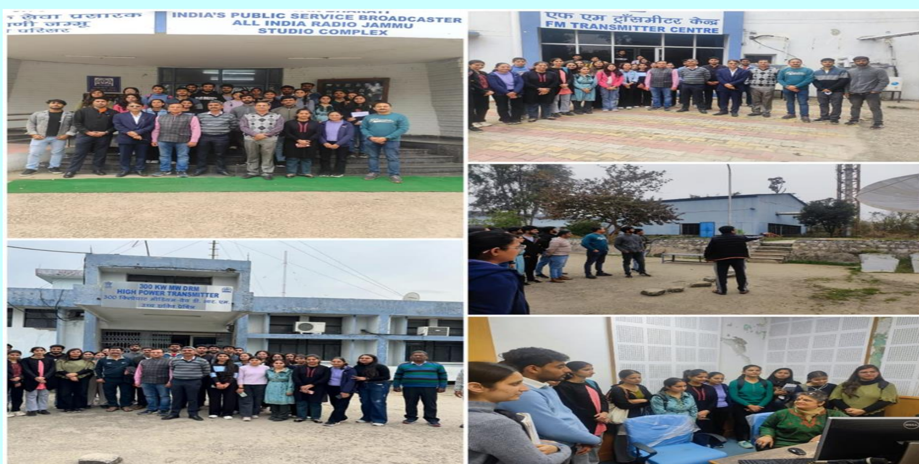
Department of Electronics, University of Jammu organised a one day field visit to All India Radio Station, Jammu on 13 March 2024.